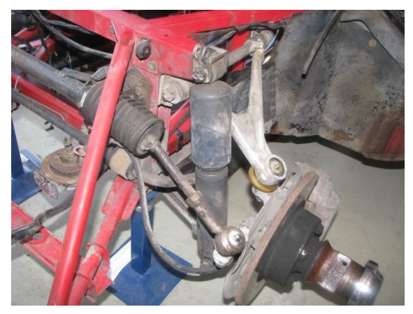
Then the engine and gearbox were removed. Then the rolling body was wheeled out of the garage for steam cleaning.