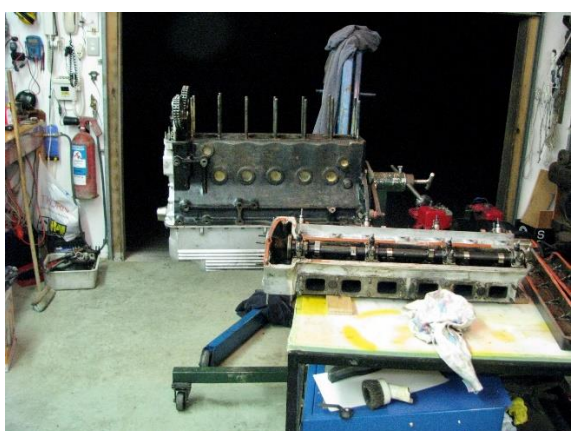
The engine and gearbox were separated and stripped down for inspection.

The car had only traveled 135000 miles and everything was standard, but I decided to replace every part I could with new while keeping it all standard also.