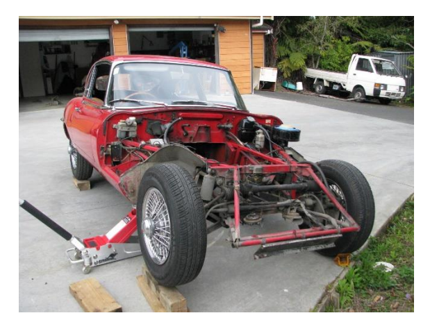
Then the body was back in the garage where every single component from the firewall forward was removed, cleaned and prepared for painting, polishing or plating. Bright zinc was the plating of choice.

I made a paint stripping tank from a 20 ltr metal drum and this stripped all paints and contaminants from everything that was to be painted.