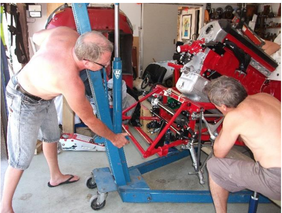
Now all the engine components could be fitted including radiator, heater box, hydraulic cylinders and all the pipes and hoses.