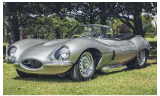
Giltrap's well-known 1957 XKSS Continuation at Lloyd Elsmore Park. It only shows 96 miles on the clock!