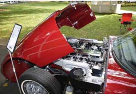
Survivor Class win by Murray Biddick's stunning Series 3 V12 E Type OTS.