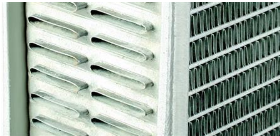
Speedway Motors Uses A Radiator Core With Two 1-Inch Wide Tubes For Better Cooling

We offer a multitude of direct bolt-in and universal fit radiators that are 100% TIG-welded, which means there is no epoxy joints or seams to fail, causing leak points. All of our single and double pass radiators are extremely efficient, lightweight, and designed with two rows of large 1-inch wide aluminum tubes in the core.