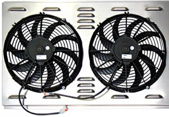
Dual Electric Fans With A Shroud Offer The Best Cooling If You Have Room For Them