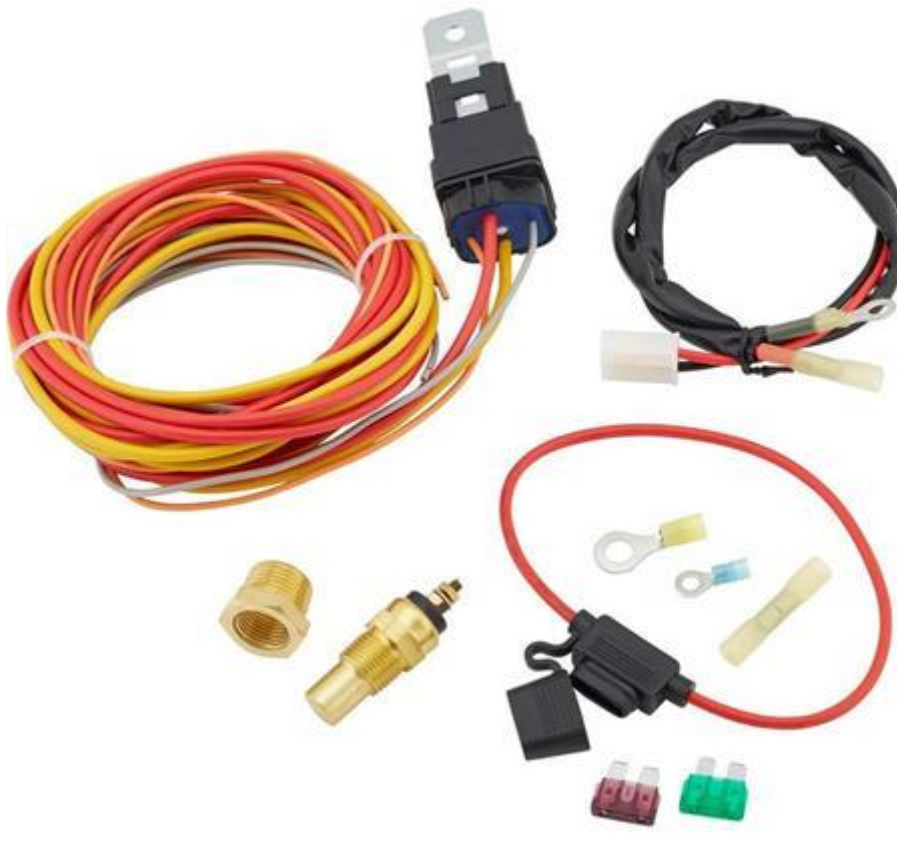
A Typical Cooling Fan Relay With Thermostatic Switch

There are many advantages of using an electric fan vs. a mechanical fan. Not only will an electric fan save horsepower, it can be mounted directly to a fan shroud and can be automatically controlled by a thermostatic temperature switch . This will reduce fan noise and current draw when the engine is running cool enough that it doesn't require additional airflow from the electric fan .