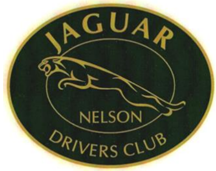
Pocket inside view