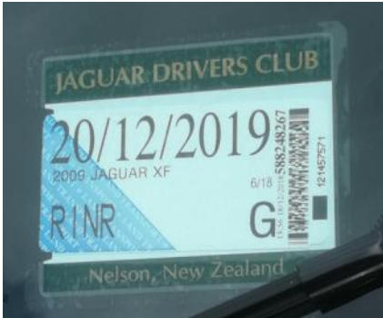
Pocket outside view