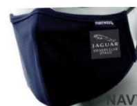
Face covering/mask with club logo Comfortable with nose bridge shaper $11.50

Name That Movie: Car No 7 1963 E Type, modified with roll bar - "Vanishing Point" 1971