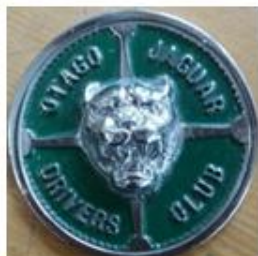
Grille Badge $35.00