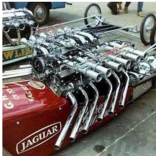
Jaguar V12 motors – so very versatile!