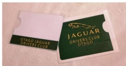
Rego Holder - Free to members